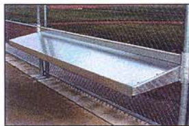
Optional Scorer's Table